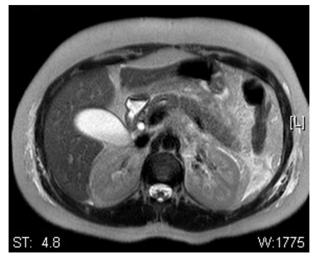
Figure 2. Previous CT changes seen in Figure 1 show T2 enhancement on MRCP.

In our patient, the history, physical examination, laboratory and radiological studies preclude more common causes such as alcohol and gallstones as well