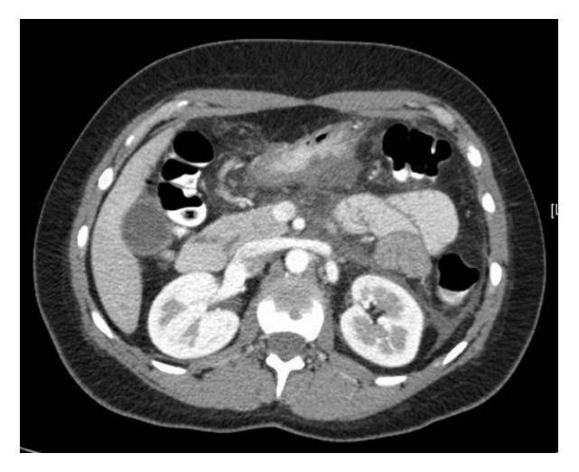
Figure 3. Normal junction of pancreatic duct and common bile duct is seen in this CT image.