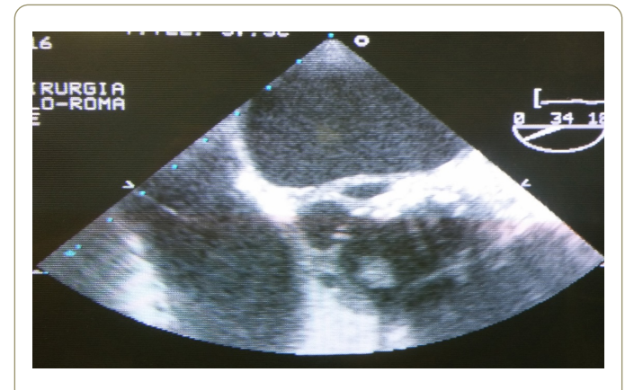
Figure 1 Intra-operative transesophageal echocardiography: view of a peri-annular abscess.

valve dehiscence [6]. Vegetations may grow both on native and prosthetic valve leaflets (Figure 3).