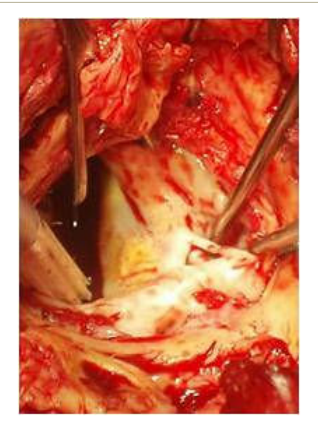
Figure 2 Surgical view of an aortic peri-annular abscess.

Some patients develop arrhythmias that can further lead to hemodynamic instability [12]. Abscesses are more common in patients with prosthetic versus native valves, reported in 40% versus 19%, respectively [6]. Roughly 22% of patients with aortic valve IE have a periannular abscess, mainly due to coagulase-negative staphylococcal infections [6,13].