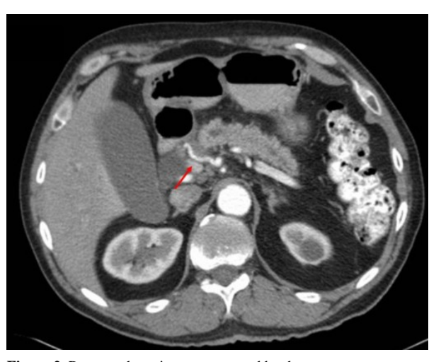
Figure 2. Remnant hepatic artery encased by the tumor.