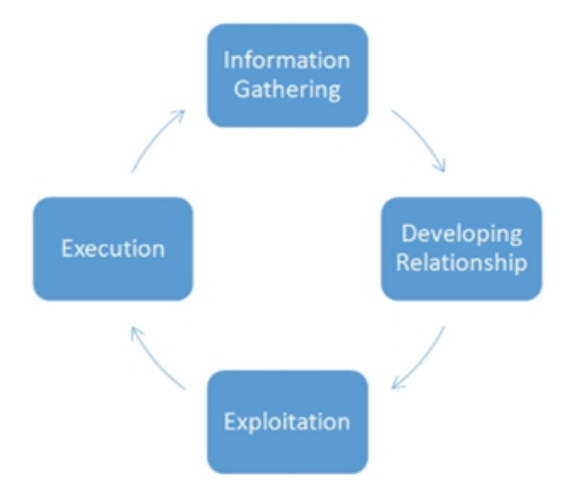
Figure 1: Attack cycle of social engineering.

Before launching an attack, attackers prepare their flow and identify a target during the information-gathering phase, also known as foot printing. The first phase includes more than just gathering information about the target; instead, it gathers additional (physical) attributes needed for the subsequent phases of the attack, such as recreating official document letterheads or learning target-related jargon and lingo. Different methods can be utilized by an aggressor to accumulate data about their objective. After this information has been gathered, it can be used to establish a relationship with the target or an important person, which can help ensure a successful attack (Figure 1). These might include disclosing information that, from a security standpoint, appears to be harmless but could be useful to the attacker. Public sources like web pages, social media posts, phone books, and job portals, among others, can be used to gather information, as can previous social engineering attacks. The information from this step is used to build a relationship with the people who are being targeted [7].