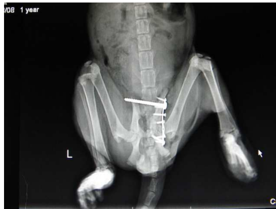
Figure- 3. Internal alignment of separated left wing of pelvic

The pelvic internal fragmental alignment was done by aligning the larger fragment of left greater ilium, using 8 holes finger bone plate and additionally a single 3 cm cancellous full threaded screw to stabilize the both ilium to the first sacral vertebral bone (Figure 3), using 8 holes finger bone plate and additionally a single 3 cm cancellous full threaded screw was used to stabilize the both ilium to the first sacral vertebral bone (Figure 4).