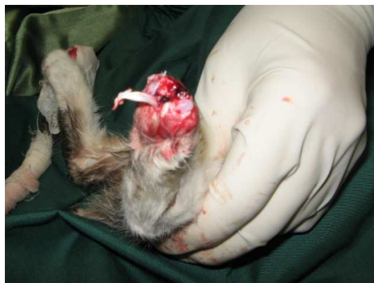
Figure- 2. Self mutilation of left paw before surgery