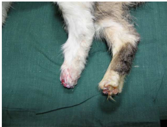
Figure- 4. Self mutilation of right paw after recovery

The cat was supported with fluid therapy (100 ml, slow I.V) Tramadol (50mg/1ml, Tehran Chemie Pharmaceutical Co. Tehran. Iran), Clemastine (2 mg/2 ml, Mino Pharmaco-Co) Furosemide (lasix, 2 mg/kg tid, Abouraihan Pharma. Co Tehran. Iran) and Cefzolib (Cefazolin, 20 mg/kg IV bid; Jaber-eben Hayan, Tehran, Iran).The recovery was supported using heating pad. The cat regained full conscious after 6 hours, then showed inclination for drinking and food .The cat was left in the cage with control ambient temperature with soft bedding, due to unknown reason cat started to show unexpected aggressive behaviors and tried to self mutilate again itself, severe bleeding from right paw which was eaten up by cat itself (no trace of paw pieces found) leading to severe hypovolemia, following vital organ hypoxia and death of the cat. (Figures 4, 5).