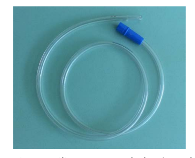
Figure 2 - Brazilian uncoated plastic catheter