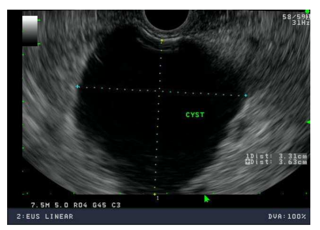
Figure 2. Endoscopic ultrasound image showing the cystic lesion prior to drainage by fine-needle aspiration.

Endoscopic ultrasound has emerged as an extremely useful modality in the diagnosis and management of cystic lesions of the pancreas [11]. EUS can provide details of the outer borders and internal architecture of cystic pancreatic lesions, thereby narrowing the differential diagnosis of pancreatic cysts. In the appropriate clinical scenario, cystic fluid analysis by