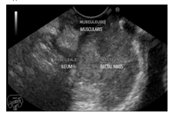
Figure 2: EUS revealed contact between the rectal mass and the distal ileum

Figure 1: EUS showed a well-defined heterogeneous slightly echogen-