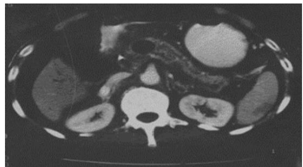
Figure 2. Post radiofrequency ablation contrast enhanced computed tomography demonstrating 3 cm diameter necrosed (non enhancing) area.

Pancreatic cancer is the third most common gastrointestinal malignancy. It is a disease with an extremely poor prognosis. Large