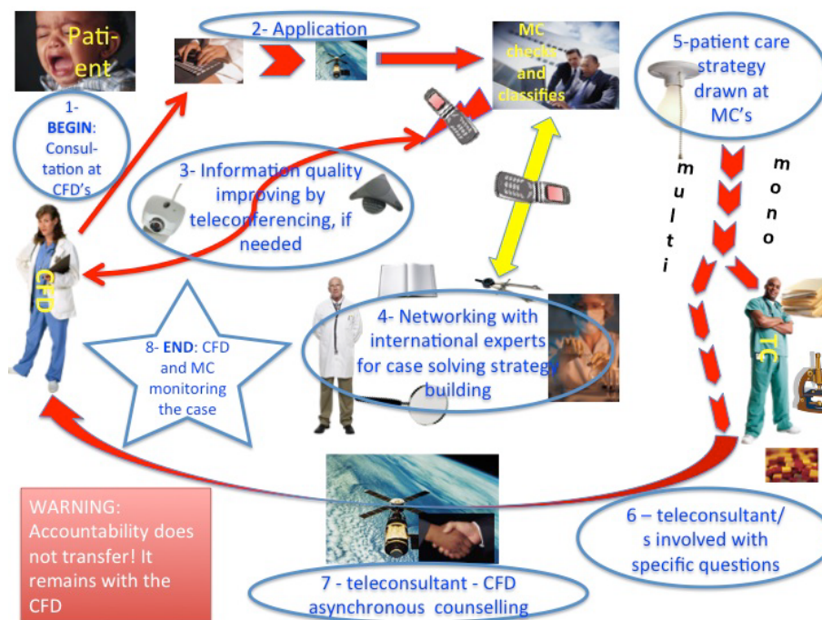
Figure 1: The process of medical teleconsultation.

text form: a) the full identification data of the patient (name, surname, gender, date of birth, municipality of residence, weight and height); b) the clinical history related to the actual reason for the consultation; c) the relevant semiotic aspects of the physical examination; d) the hypothesized diagnosis or the differential diagnosis diagram; e) on-going and relevant previous medications and f) the specific demands or questions he wishes to be addressed by the consultants. The free text application may have attachments such as pictures of important semiotic features (e.g. lesions of the skin, of goiter, etc.) to show, X-ray tests, electrocardiograms, growth cards, and other significant and pertinent clinical documents in the most common electronic formats (JPEG, PDF, Word, Mp4, etc.).