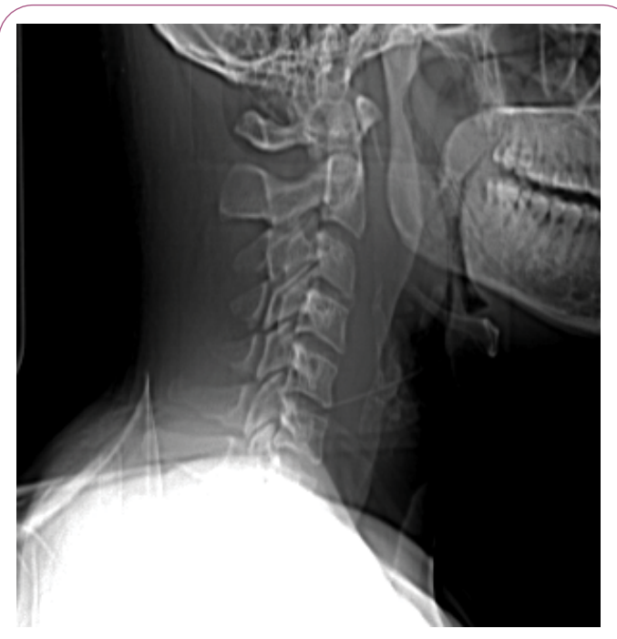
Figure 5 Scanogram of CT scan of same patient showing intact cervical spine.

Extrapulmonary tuberculosis (TB) accounted for approximately 25% of the total tuberculous morbidity [10].