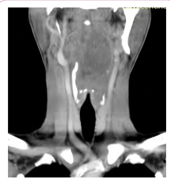
Figure 4 Contrast enhanced coronal CT image showing prevertebral abscess displacing left carotid vessels laterally (arrow).