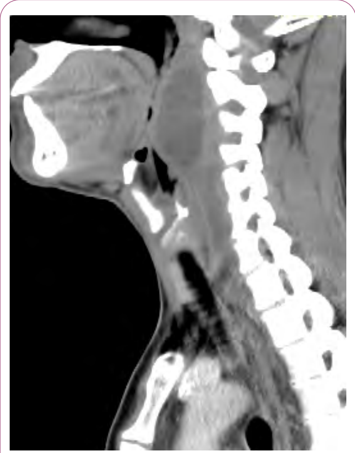
Figure 3 Contrast enhanced sagittal CT image showing retropharyngeal abscess with extension to the retrolaryngeal region (arrow).