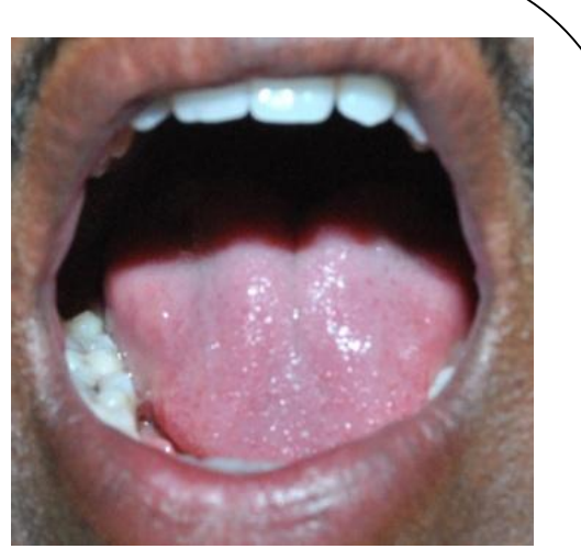
Male-I: After 72 hrs of Application