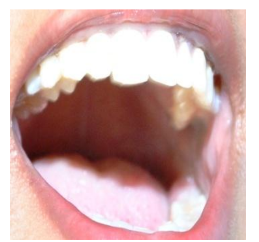
Female: Before Application