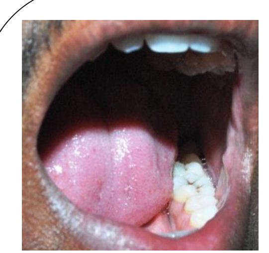
Male-I: Before Application