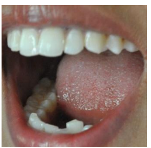
Female: After 72 hrs of Application

Figure 3. Oral Mucosal Compatibility studies of prepared jelly formulations without Drug in Healthy Human Volunteers