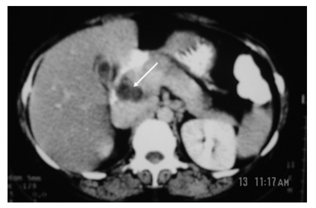
Figure 1. CT abdomen showing a multiloculated, hypoattenuated space-occupying lesion (arrow) in the head of the pancreas.

On two occasions, fine needle aspiration cytology from the supraclavicular lymph node revealed only a few inflammatory cells. An excision biopsy of the node showed caseating granulomas and smear was positive for acid fast bacilli.