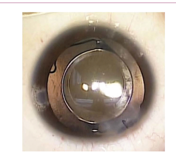
Figure 3: Postoperative lens appearance demonstrated with well-cantered lens within capsular bag.

The patient did extremely well and on post-operative day one presented with a quiet and clear left eye and uncorrected visual acuity of 20/25. Two months post-operatively, the eye was quiet with uncorrected visual acuity of 20/20. No posterior synechiae or iris captures were seen. The patient had no inflammation and was off topical steroids within 3 weeks of surgery.