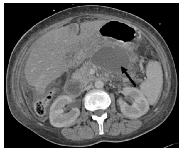
Figure 1. CT scan at admission showing pancreatic necrosis and a large pseudocyst (arrowed).

which the patient was anti-coagulated. As the pseudocyst decreased in size (5 cm diameter) on CT imaging, no drainage was attempted on that admission. Four months later she was re-admitted as an emergency with acute upper abdominal pain and vomiting. On arrival, the patient was unwell, dehydrated and tachycardic. The clinical diagnosis of pancreatitis was confirmed by the raised serum amylase of 203 U/L (reference range: 0-135 U/L). The APACHE II score was 11 (adjusted predicted death rate of 19.6%). Within 12 hours she rapidly deteriorated, developed type I respiratory failure and required respiratory support. The contrast CT revealed that the known pseudocyst had increased in size, measuring 11.7x5.0 cm with features of pancreatic necrosis (Figure 1) and