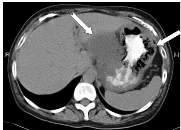
Figure 2. A contrast-enhanced CT scan demonstrating thickened gastric wall containing intra-mural gas (straight arrow) with associated pancreatic pseudocyst (notched arrow).

Arterial complications of pancreatitis usually present as haemorrhage into the abdominal cavity or gastrointestinal tract due to vascular erosion or pseudoaneurysm rupture, although cases of arterial thrombosis, and subsequent occlusion, are well-documented [1, 2, 3, 4]. Patients with peripancreatic arterial obstruction as a consequence of pancreatitis can present with sudden and unexplained clinical deterioration and hence prompt diagnosis and timely surgical intervention is required.