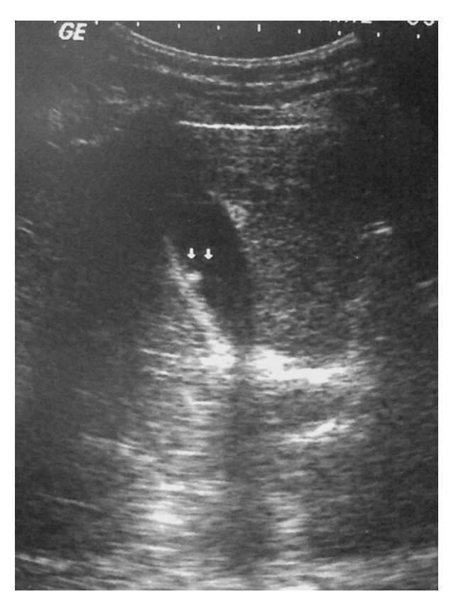
Figure 1. An echogenic non-mobile structure attached to the gallbladder wall (small arrows) with no posterior shadowing. Features suggestive of a polyp.

heterotopia of the gallbladder have been reported in the medical literature published in English, as shown by the database of medical search engines: PubMed (http://www.ncbi. nlm.nih.gov/pubmed/) and OVID (http://www.ovid. com/site/index.jsp) [1, 4, 5, 6, 7, 8, 9, 10, 11, 12, 13, 14, 15, 16, 17, 18, 19, 20, 21,22, 23, 24, 25, 26, 27, 28, 29, 30].