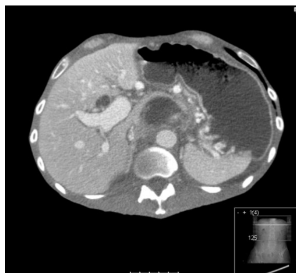
Figure 1. CT scan showing pseudotumoral cystic lesion in head of pancreas.

A contrast enhanced pancreatic protocol CT from November 2008 demonstrated ductal irregularities and pancreatic parenchymal calcification associated with a possible superior mesenteric vein thrombosis. He was readmitted in March 2009 for an exacerbation of abdominal pain and weight loss. He was treated with pancreatic rest, nutritional support, and analgesia. His serum biochemistry demonstrated an elevated CA 19-9 (1,000 IU/mL; reference range: 0-34 IU/mL) and CEA (17 µg/L; reference range: 0-4 µg/L) and an urgent abdominal CT scan demonstrated a 3.5x5.0 cm solid/cystic mass associated with the head of pancreas (Figure 1). The portal vein appeared severely attenuated at its origin for approximately 2 cm but