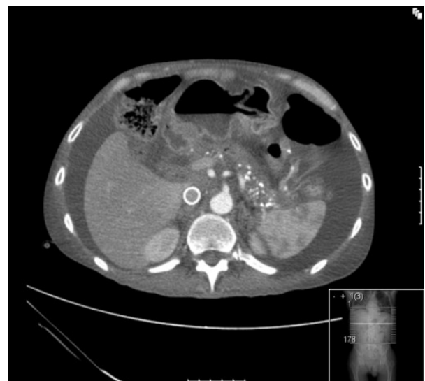
Figure 3. CT scan done at 2 months showing complete resolution of pancreatic lesion and showing a metallic stent in place in the inferior vena cava.

Chronic calcifying pancreatitis is invariably related to alcoholism [1]. The earliest finding is precipitation of pertinacious material in the pancreatic ducts that subsequently calcify. Many of the small pancreatic ductules dilate, while others are obliterated by fibrosis. About 50% of patients with chronic calcific pancreatitis have pancreatic cysts of varying sizes (several millimeters to 5 cm). Peripancreatic fibrosis is usually a late finding and may involve the portal and/or splenic veins [2]. Peripancreatic fibrosis causes stenosis or occlusion of retroperitoneal lymph channels and ascites may complicate chronic calcific pancreatitis as a result of portal hypertension or lymphatic obstruction in 1-2% patients [3, 4]. Our patient had progressive disease over a 14-year period culminating in what appeared to be malignant change in the background of alcohol induced chronic pancreatitis. Occlusion of the superior mesenteric vein at its origin had been present for almost a year, although there had been no evidence of more extensive fibrosis. Lymphangiography failed to demonstrate occlusive lymphatic disease that may have lead to the large volume chylous ascites, and its sudden onset post-endoscopic biopsy may suggest direct iatrogenic injury to the lymphatic channels around the head of the