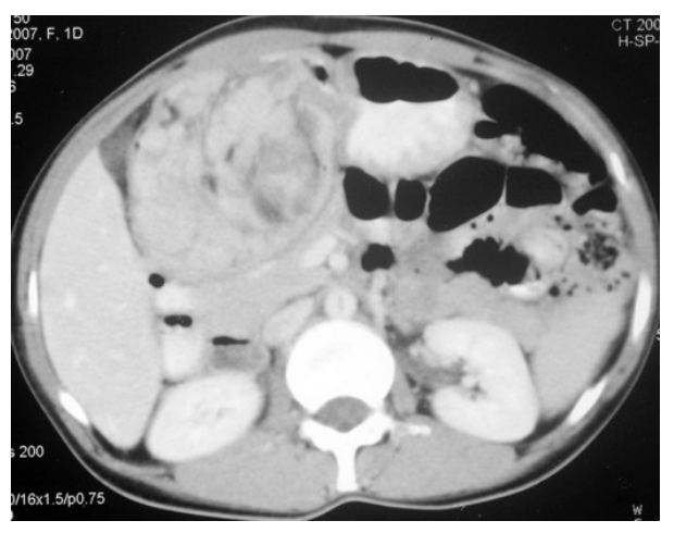
Figure 1. Axial CECT section shows a large heterogeneous mass lesion in relation to the antropyloric region of the stomach and the C loop of the duodenum. Fat plane with the head of the pancreas is preserved.

were separated from the uncinate process as is done in a standard pancreaticoduodenectomy. Cholecystectomy was performed in a retrograde fashion and a catheter was introduced through the cystic duct stump to identify the papilla. The dissection was continued in the interface between the pancreas and the duodenum by ligating and dividing all the vessels. Upon reaching the major papilla, the duodenum was made taut and the papilla was divided. During the course of the dissection, the minor papilla was ligated.