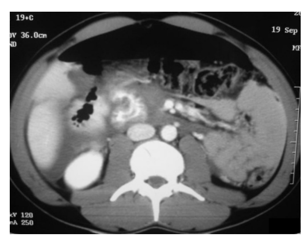
Figure 1. CECT showing extravasation of oral contrast from duodenum.

One patient (Case 1) was re-explored 36 hours later for bleeding from the drain placed near the pancreas. There was diffuse ooze from the retroperitoneum. The anastomoses were intact.