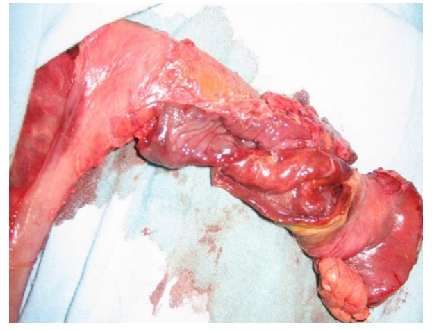
Figure 2. Complex duodenal injury with extensive laceration.

Jejunostomy tube feeding was started after 5 days. An upper gastrointestinal gastrografin study ten days later revealed no anastomotic leak and the patients were then put on oral feeding.