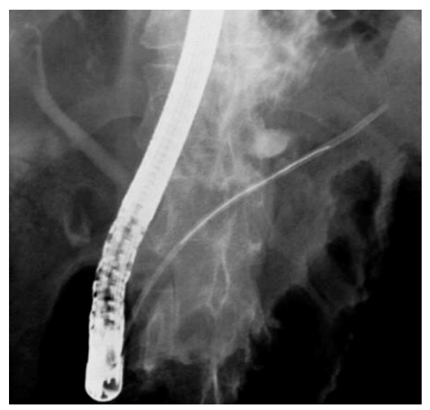
Figure 2. ERCP showing extravasation of contrast through the fistula passing upwards, and a pancreatic stent.

Lipsett and Cameron [21] treated 16 cases of pancreaticopleural fistula, conservatively with nasogastric TPN, suction and antisecretagogues, such as atropine and recently somatostatin. They were subsequently treated with thoracentesis and chest drain, if effusion failed to resolve. The conservative treatment failed in 50% of the patients who subsequently required surgery.