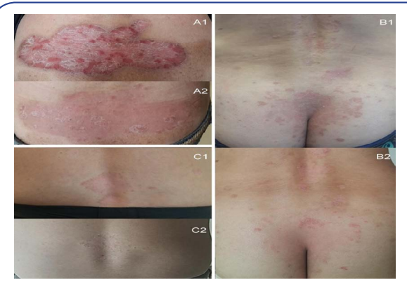
Note: A, B, C referred to group A, group B and group C respectively; 1-baseline; 2-After the treatment.

A series of clinical studies have demonstrated that standard once daily application of calcipotriol/betamethasone dipropionate ointment could induce a rapid improvement of psoriasis vulgaris of active stage over 4-week treatment [11-13]. But these