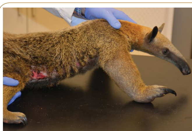
Figure 2 Clinical photograph, Case 2. Sarcoptic mange; diffuse erythema, hypotrichosis to alopecia, with scaling and focal crusting along the face, distal extremities, and ventral surfaces of a capybara ( Hydrochoeris hydrochaeris ).