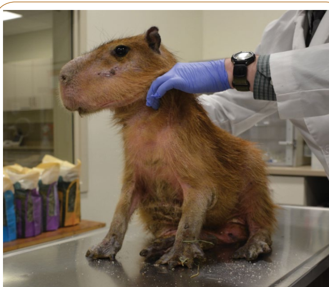
Figure 1 Clinical photograph, Case 1. Sarcoptic mange; excoriation and crusting along the right flank of a southern tamandua ( Tamandua tetradactyla ).

DNA was extracted from skin scrapings obtained from both hosts, using the DNeasy Blood and Tissue Kit (QIAGEN Inc., Valencia, California 91355, USA) and following manufacturer's protocol. DNA was eluted in 200 µL of water and stored at -20°C. 700 base pairs of the mitochondrial cytochrome C oxidase subunit 1 (Cox1) were amplified in 50 µL reactions, using 2 µL of DNA, 3 mmol