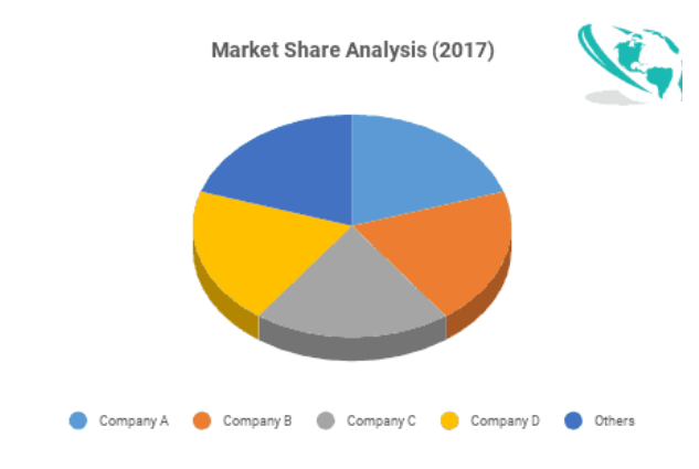
Healthcare informatics Market: type Insights

The need for an integrated system to diagnose, interpret & analyze, treat and record information is predicted to increase preference for healthcare informatics. These systems helps health care provides deliver correct treatments instantly by analysis past records and coverings. However, an information security issue including lack of skilled IT professionals is anticipated to lag the market growth over the coming years.