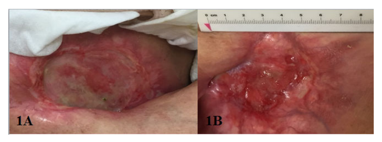
Figure 1: The clinical presentation at diagnosis (the 28th day of everolimus) (1A) and 3 months after the discontinuation of everolimus administration (1B).

A low power view showed a population of predominantly neutrophils in a perivascular and interstitial pattern in addition to those undergoing extravasation from the vessels. Fibrinoid necrosis of the vessels with fibrin extravasation was also present (Figure 2).