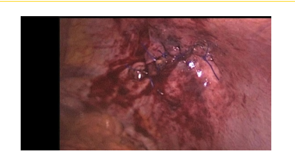
Figure 4: Diaphragmatic defect after repair with non-absorbable sutures.

Herniated organs were gently reduced to abdomen; there was no ischemia sign in herniated colon segment. Diaphragmatic defect was repaired with 2.0 polypropylene stitches ( Figure 4 ). 15 \times 15 cm composite mesh was placed to left diaphragm and fixed with absorbable tackers ( Figure 5 ). During fixation we avoid the diaphragmatic vessel injury. Patient was discharged uneventfully on postoperative third day. Patient gave informed consent about the publishing of her operation data and documents for scientific purposes.