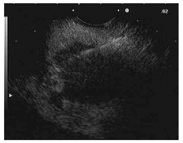
Figure 2. Endoscopic ultrasound guided fine needle aspiration of the pancreatic mass.

She returned to her primary care physician 3 weeks later with a 8 kg weight loss, malaise, and continued epigastric and back pain. A computed tomographic (CT) scan of the abdomen and pelvis was performed revealing a large complex heterogeneous mass (6.8x8.4 cm) in the neck of the pancreas that appeared to invade the liver (Figure 1). The mass