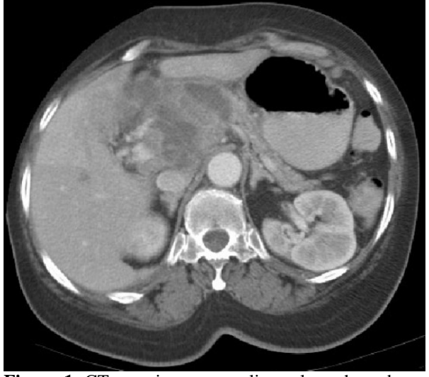
Figure 1. CT scan image revealing a large hypodense mass involving the head and neck of the pancreas and seemingly invading the left lobe of the liver.

nitrogen (BUN), creatinine, bilirubin, transaminases, amylase and lipase were normal. Alkaline phosphatase was minimally elevated (193 IU/L; reference range: 40-125 IU/L). Thoracic and lumbar spine X-rays were unremarkable. The patient was treated empirically with omeprazole (20 mg/day) and advised to stop ibuprofen.