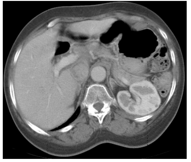
Figure 4. CT scan image showing resolution of pancreatic mass after three months of anti-tubercular treatment.

identified as Mycobacterium tuberculosis by deoxyribonucleic acid (DNA) probe.