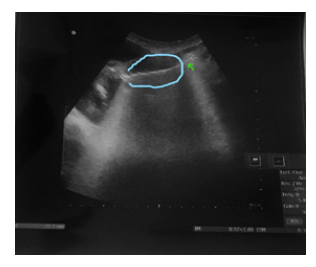
Figure 2: Ultrasound image showing uterine perforation (blue: uterus boundary, green arrow: exiting of the tandem)

with the physical properties of the dose distribution in the order of 10%/mm. It is therefore logical that optimal placement of the brachytherapy tandem applicator is strongly associated with superior outcomes. In addition, treating with a tandem that has perforated the uterus is associated with significant gastrointestinal toxicity [9]. For these reasons, optimal applicator placement, including the intra-uterine placement of the tandem is an integral component of optimal therapy for carcinoma of the cervix.