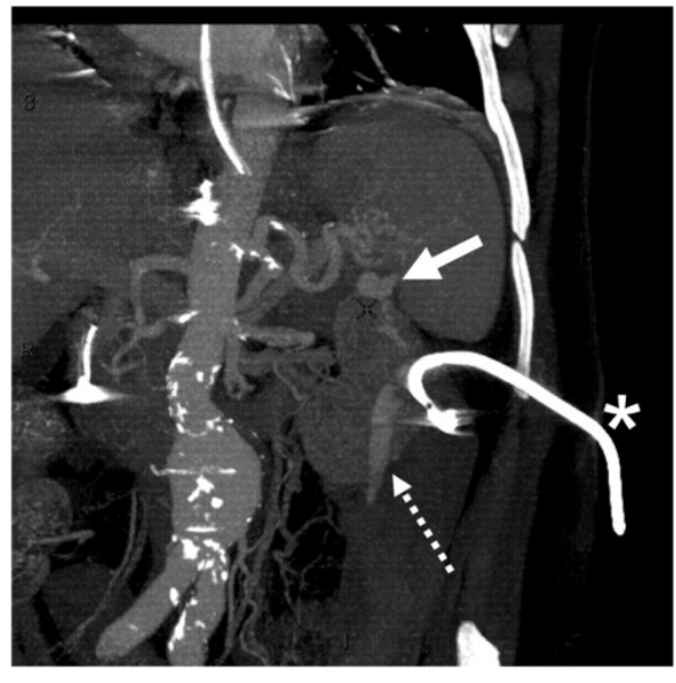
Figure 1. Coronal reformatted CT image demonstrates a splenic artery pseudoaneurysm (arrow), percutaneous drain (asterisk) and active extravasation of intravenous contrast (interrupted arrow) extending inferiorly from the region of the pseudoaneurysm and percutaneous drain.