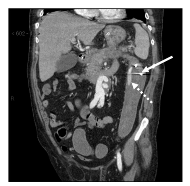
Figure 2. Coronal reformatted CT image demonstrates the position of the percutaneous drain in the colon lumen (arrow) and extravasated intravenous contrast mixed with unopacified blood in the descending colon (interrupted arrow).

Acute pancreatitis is often classified into two subgroups: mild acute pancreatitis and severe acute pancreatitis. Severe acute pancreatitis occurs in about 25% of patients with acute pancreatitis and is associated with multiple organ dysfunction syndrome with or without local complications. Local complications include acute peripancreatic fluid collections, pseudocysts, abscesses, and pancreatic necrosis. Peripancreatic fluid collections are known