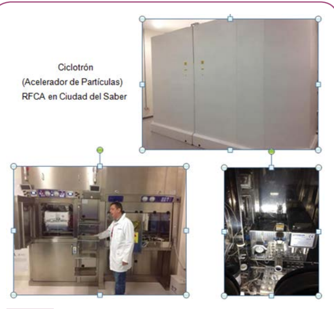
Figure 2 Cyclotron (particle accelerator) RFCA in the city of knowledge.

FDG, as a glucose analogue, is mainly incorporated by those cells with high rates of glucose consumption such as the brain, kidney and cancer or inflammatory cells, where phosphorylation prevents it from being released into the medium. The metabolically active cells show an increase in the expression of glucose transport proteins, which introduce the FDG inside the cells, where it is phosphorylated to 18F-FDG-6-Phosphate. 18F-FDG-6-Phosphate is trapped in the cytoplasm, since the enzyme Glucose-6-Phosphate-Dehydrogenase has no action on this variant of glucose, stopping at this stage the metabolism of fluorinated glucose. This fact, and the overexposure of the GLUT transport proteins, allows the FGD to accumulate inside the cell and there is a higher concentration of the tracer in the metabolically active cells in relation to the normal tissue, which provides a high contrast ratio. While the radioactivity of the FDG remains, the molecule cannot be degraded or used in any metabolic pathway, because of the radioactive Fluorine in position 2 of the molecule. However, as the radioactivity decays, the fluorine will turn into 180, which will be able to capture a cation of H<sup>+</sup>, and thus become Glucose-6-phosphate, marked with heavy oxygen (oxygen-18) totally innocuous in position 2, which may be metabolized normally by any of the ordinary routes used by glucose.