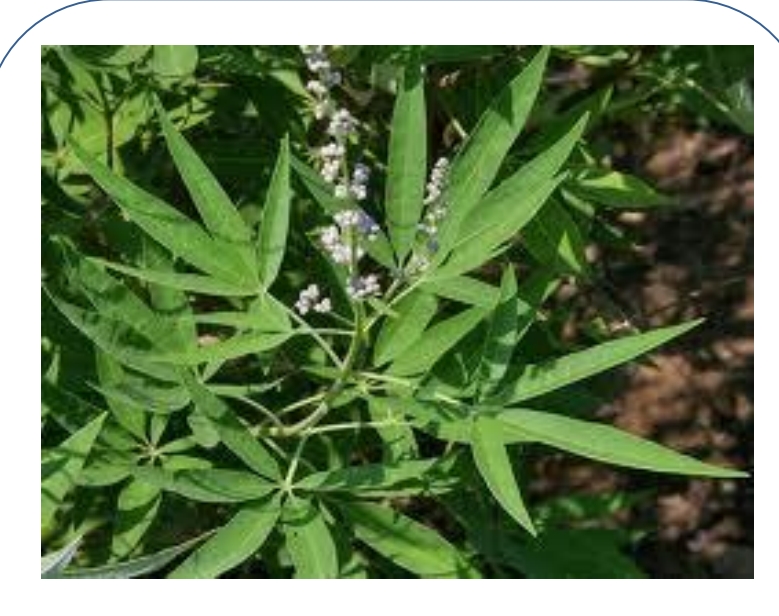
Figure 2. Vitex negundo Linn. Leaves used in preparation of alcoholic herbal extract