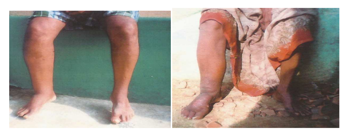
Fig: 3 Filariasis (Stage – I)