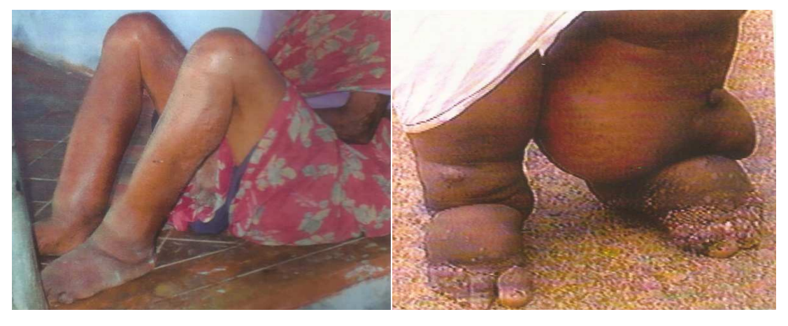
Fig: 5 Filariasis (Stage - III)