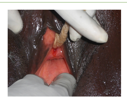
Figure 1 Gross appearance of surgical sponge protruding from urethral orifice.

A 45 year old multiparous woman presented with an eight week history of dysuria, fever, chills, frequency, nocturia, straining, feeling of incomplete emptying, urge incontinence and lower abdominal pain associated with a three day history of protrusion of a whitish substance from the urethral orifice (Figure 1).