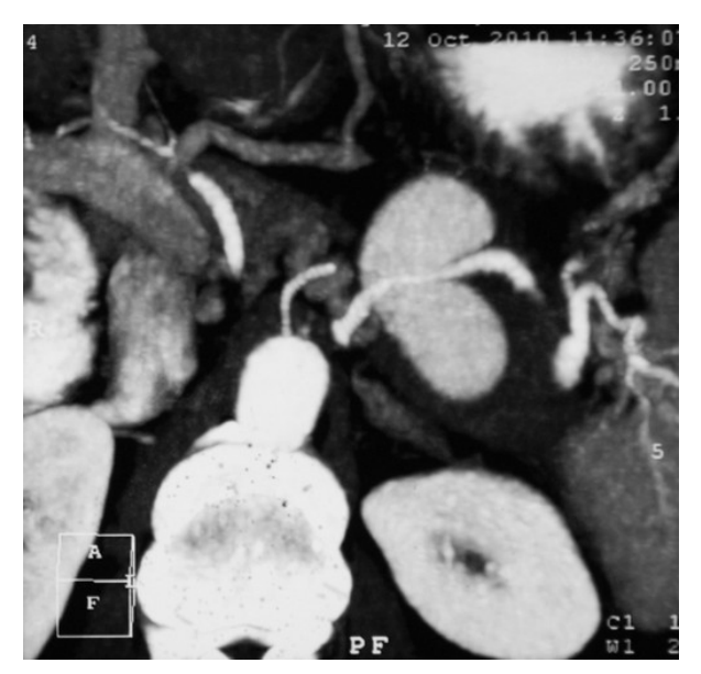
Figure 2. CT scan coronal reconstruction showing a giant pseudoaneurysm of the splenic artery with the artery passing through the pseudoaneurysm.

Visceral artery pseudoaneurysms are uncommon. The splenic artery is the most commonly affected visceral artery [1]. They usually develop secondary to pancreatic diseases. They develop more commonly in chronic pancreatitis (46%) than in acute pancreatitis (6%) [1]. Our patient developed a splenic artery pseudoaneurysm secondary to chronic pancreatitis. The