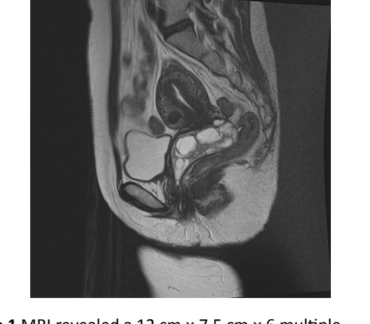
Figure 1 MRI revealed a 12 cm × 7.5 cm × 6 multiple intracavitary mass and smooth margins on high signal intensity on T2-weighted images.

A 48-year-old woman, grava 2 para 2, spontaneously presented to the gynecological consultation of the Nasu Red Cross Hospital of Tochigi for abnormal vaginal bleeding. She had no particular clinical history. She described an intermittent vaginal bleeding not related to the cycle and the vaginal bleeding occurred sometimes suddenly. Colposcopy was performed to observe a firm pink mass, not-well vascularized that originate from the posterior lip of the cervix. Magnetic resonance imaging (MRI) revealed a 12 cm × 7.5 cm × 6 cm multiple intracavitary mass and smooth margins on high signal intensity on T2-weighted images (Figure 1). Radiological findings showed malignant tumor with polycystic lesion in uterine cervix such as uterine adenoma malignum. Whereas the colposcopic impression suggested a myoma of the posterior.