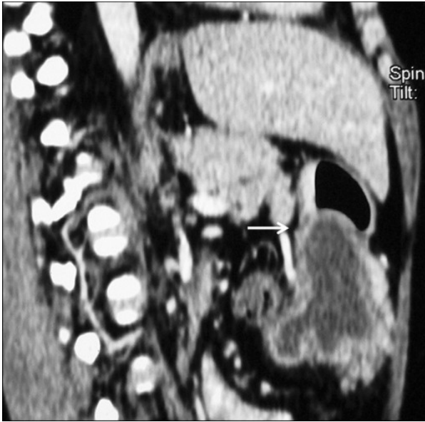
Figure 1. Contrast-enhanced CT (sagittal multiplanar reconstruction) of the abdomen shows a hypodense cystic lesion indenting the stomach wall (arrow). Finger-like projections are seen along the inferior aspect of the cyst.

had a normal mucosal lining with no communication to the stomach. Histology confirmed a duplication cyst with pancreatic tissue on the serosal surface of the cyst.