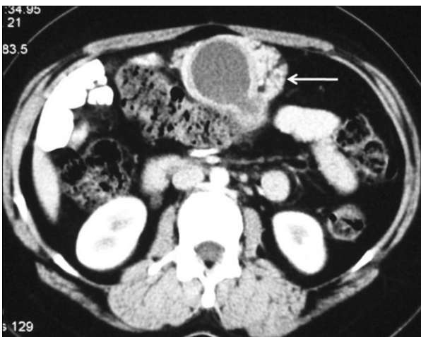
Figure 2. Contrast-enhanced CT (axial sections) of the abdomen showing a well-defined cystic lesion surrounded, on its anterior and lateral walls, by an enhancing soft tissue mass with stippled fat density areas within (arrow), similar to pancreatic tissue. The cyst wall has a two layered appearance, with an inner thin hypodense layer and an outer enhancing layer.

A gastric duplication cyst is one of the uncommon congenital anomalies involving the gastrointestinal tract. Duplication cysts of the stomach are the rarest type accounting for 7% of intestinal duplications [4]. Morphologically, they are classified as cystic and tubular [1]. The majority of patients (70%) present in infancy or childhood [5]. A duplication cyst in the adult age group is often asymptomatic and is, for the most part, detected incidentally. Patients may present