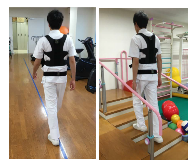
Figure 1: Using a 2-point gait oscillometer MVP-WS2-S.