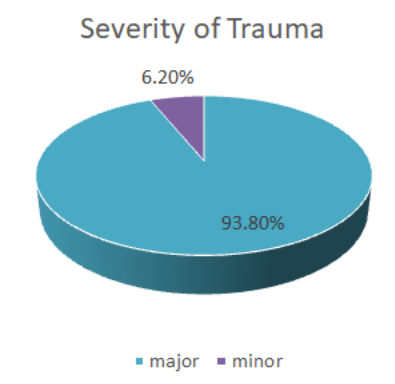
Figure 2: 93.8% of participants suffered major injuries with regards to severity with a score >9 on the ISS.