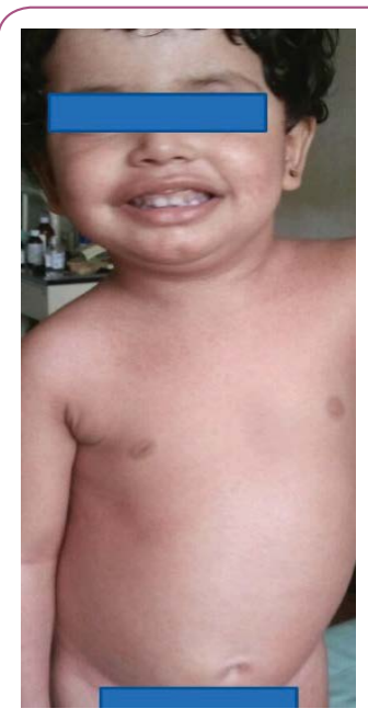
Figure 5 Resolution of lesions after 4 weeks of cyclosporine therapy.

Cyclosporine is a cyclic endecapeptide of fungal origin used as an immunopresent. There apprear to be several ways in which cyclosporine can exert its effect as an antipsoriatic drug: Ca<sup>2+</sup> signal modulation, inhibition of membrane phospholipid metabolism, interference with cell surface receptors, inhibition of lymphokine production or inhibition of MHC (major histocompatibility) class II expression [8]. Our patient was started on oral cyclosporine 2 mg/kg/day. In a study [9], of effect of cyclosporine treatment in generalized pustular psoriasis, patients responded to cyclosporine 2 mg/kg/day within 2 weeks. Our patient showed improvement with the same dosage in a similar time span, but in spite of this progressed to erythroderma while still on treatment after she was discharged. On her second hospital admission, her cyclosporine dosage was increased. UVB phototherapy of 311 nm is inappropriate during febrile illnesses, but has been demonstrated as effective adjunctive therapy for maintenance of GPP [2]. But in her case, it had to be discontinued as she developed erythema and severe itching after a single sitting of phototherapy. This patient achieved remission after 4 weeks of