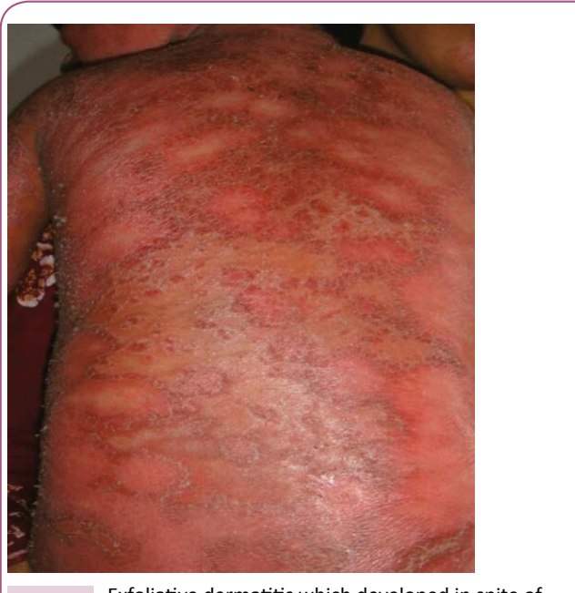
Figure 3 Exfoliative dermatitis which developed in spite of treatment.