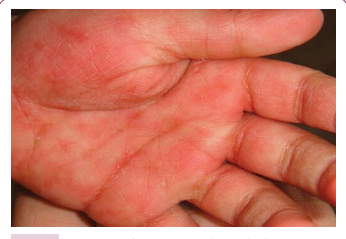
Figure 4 Minute pustules seen over palms and soles.

occurs in both adults and children, but review of the literature reveals a relatively higher proportion of children [3] But later on she developed erythroderma, and had several minute pustules all over her body and also the palms and soles. She most likely had a mixed variant of pustular psoriasis, demonstrating features of both the von Zumbusch and annular patterns.