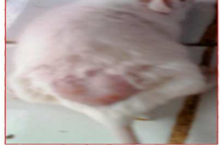
5. DMBA+900 mg/kg b.wt/d CSLE