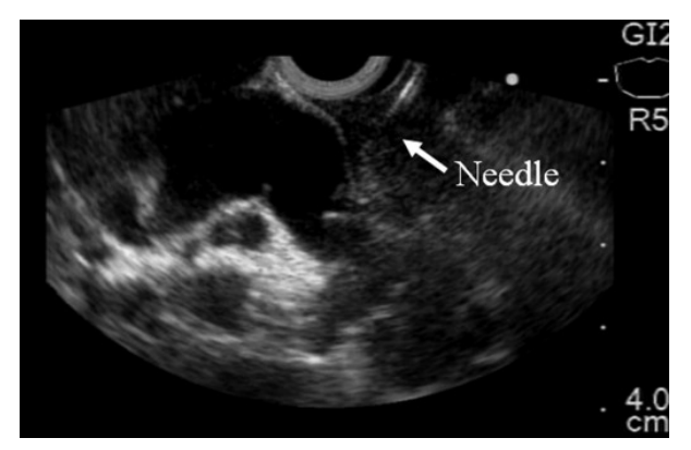
Figure 2. EUS linear image demonstrating common bile duct puncture.

A 0.035 inch guidewire was introduced through the EUS needle, using fluoroscopy. An attempt was made