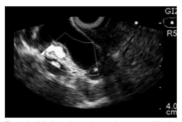
Figure 1. EUS linear image demonstrating common bile duct dilatation.

fentanyl and propofol. It was a procedure involving an obstructed biliary system, and a prophylactic antibiotic (ciprofloxacin 400 mg i.v.) was used, only in the beginning of the procedure.