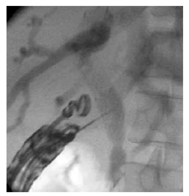
Figure 3. EUS guided cholangiography.

to pass the guidewire through the lesion to reach the duodenum as a "rendezvous" maneuver, without success.