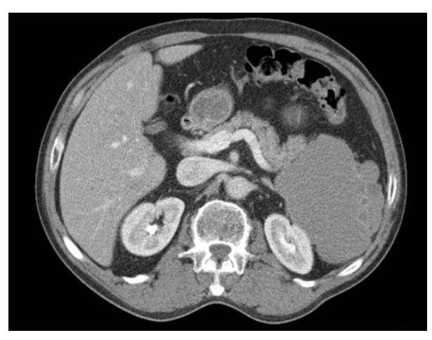
Figure 1. Computed tomography (CT) scan demonstrating a large, left-sided cystic mass near the tail of the pancreas.

transferred to our tertiary academic medical center. Abdominal surgical exploration revealed a large mass containing a cystic cavity (4.8x3.7x1.9 cm in aggregate) consisting of hemorrhagic fatty soft tissue and purulent appearing debris originating from the tail of the pancreas. The cyst was removed and sent for pathologic examination. Microscopy revealed multiple epidermoid cysts within accessory splenic tissue (Figure 2). The cysts were lined by stratified squamous epithelium, some of which was keratinizing, and were variable in size. Several cysts appeared to have ruptured and had surrounding fat necrosis and foreign body giant cells. The lining of the cysts was positive