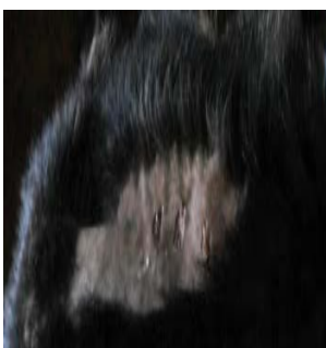
Figure 6 Day 30-Healed Wounds created on WAD trunk.

It is pertinent to note that the healing patterns of the head, trunk and leg in male and female goats showed similar patterns ( Figure 8 ). However, it is important to note the anatomical peculiarities of these three parts of the body. The leg is less fleshy and poorly vascularized than the trunk and the head which may lead to poor angiogenic response during wound healing. In the same vein, the trunk is more vascularized and fleshy than the head and is expected to heal faster than the head. The observed pattern of healing on the three parts of the body under this study is better explained in this manner. Also, angiogenic activities were also better based on the histo pathological samples obtained from these three sites showed that inflammatory stage did not prolong unnecessarily in the head and trunk while the leg had a prolonged inflammatory phase because of poor angiogenic activities and increased macrophage activities which might have resulted from infectious contamination due to proximity to the floor where there is abundance of microbial agents. Though it was observed that the patterns of healing were similar in the male and female goats in this study but females had faster healing rates than the males. Female estrogens (estrone and 17 \beta -estradiol), male androgens (testosterone and 5 \alpha -dihydrotestosterone, DHT), and their steroid precursor dehydroepiandrosterone (DHEA) appear