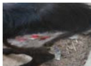
Figure 3 Wounds created on WAD leg.