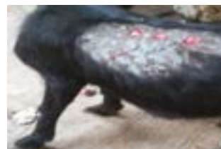
Figure 4 Fresh wounds on WAD trunk.