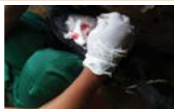
Figure 2 Wound creation on the WAD trunk.