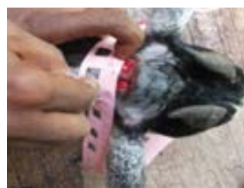
Figure 1 Template being used to create wounds on WAD head.

In the male goat, throughout the course of healing, the trunk showed the most contraction followed by the head and the least being the leg. There was significant difference ( P < 0.05 ) in healing between the head, trunk and leg in the maturation phase