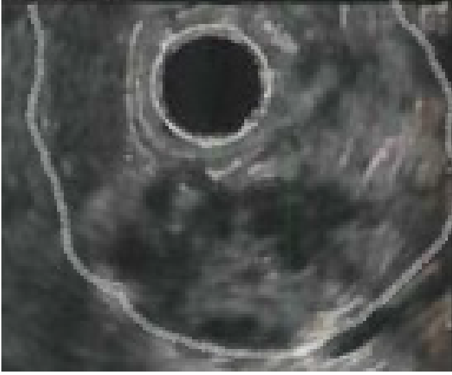
Figure 2. Endoscopic ultrasound reveals a solid heterogeneous mass (24 mm by 23 mm maximal cross-sectional diameter), with a spiculated appearance