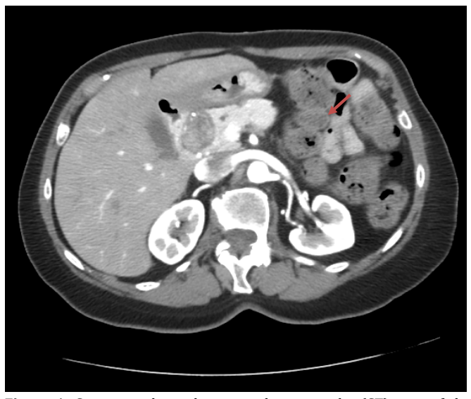
Figure 1. Contrast enhanced computed tomography (CT) scan of the abdomen showing a pancreatic head mass (arrow), with heterogeneous enhancement.

Pre-operative diagnosis of pancreatic schwannomas is difficult even with multiple imaging modalities. Computed tomography (CT) scan can be helpful in distinguishing solid from cystic lesions and help in determining