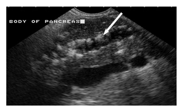
Figure 1. EUS confirming the presence of calcification within the wall of the dilated main pancreatic duct. Parenchymal echogenic foci are also noted. Image obtained on a linear endoscope (PEF-703FA, Toshiba, Crawley, United Kingdom).

The aim of this study was to assess the role of EUS in patients with histories suggestive of EUS in whom CT and ERCP or MRCP had proved non-diagnostic to determine whether targeted use of EUS is optimal usage of this currently limited resource.