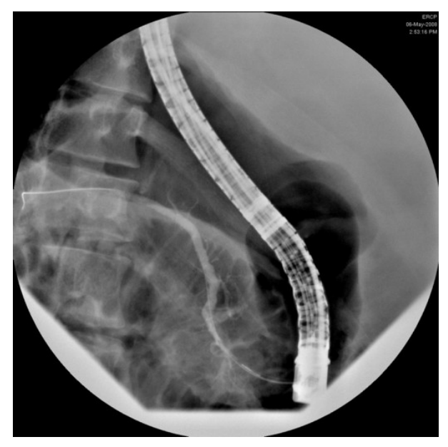
\textbf{Figure 4.} \ \ \textbf{Pancreatogram after stent removal showing no leak}.

A number of complications can be associated with pancreatic injury, the most common being pancreatic duct disruption [8, 9]. CECT of the abdomen can detect parenchymal lesions but ductal disruption is commonly missed [10]. However, recent articles in the literature suggest that CT has a 90% sensitivity for detecting pancreatic ductal disruption [11]. Gougeon et al. [12] first reported the use of emergency ERCP in the diagnosis of pancreatic injury in 1976. ERCP has a sensitivity and specificity of 100% for pancreatic ductal injury [13]. It can be used preoperatively, intraoperatively and postoperatively in patients with