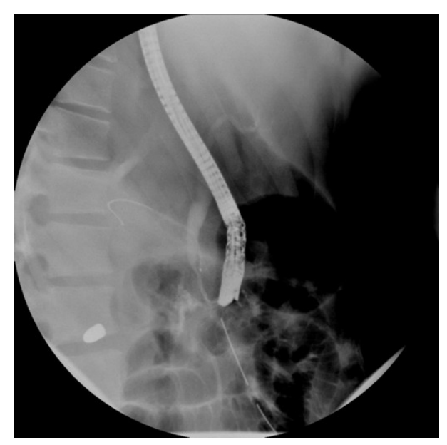
Figure 2. Pancreatogram demonstrating pancreatic duct leak.

Drain output did not decrease despite one month of conservative management. Endoscopic retrograde cholangiopancreatography (ERCP) was carried out one month after the injury. A pancreatogram showed proximal pancreatic duct disruption (type IIIb injury) [4] with leakage of dye but a normal distal duct (Figure 2)