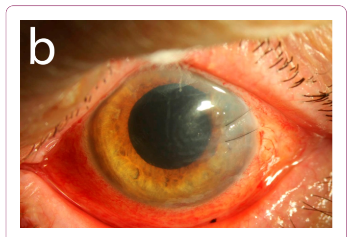
Figure 2b: After pars plana vitrectomy, the follow up exam showed improvement of corneal edema and anterior chamber reaction with resolution of the hypopyon. The temporal clear corneal incision was closed with two interrupted 10-0 nylon sutures. Vision improved to 20/40 ten weeks postoperatively after suture removal.

A contact B-scan echography demonstrated dense vitreous and sub-hyaloid opacities consistent with endophthalmitis. The patient underwent immediate pars-plana vitrectomy and intravitreal injections of vancomycin 1 mg/ 0.1 mL, ceftazidime 2.25 mg/ 0.1 mL, and dexamethasone 0.4 mg/ 0.1 mL. Intraoperatively, a wound leak was confirmed from the temporal clear corneal incision, and was closed with two interrupted 10-0 nylon sutures (Figure 2b).