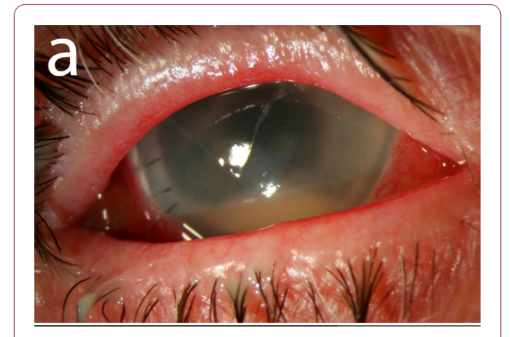
Figure 1a: 86 year old female with acute-onset endophthalmitis after IOL exchange. Slit lamp examination demonstrated a fibrinous anterior chamber reaction with hypopyon. Six interrupted 10-0 nylon sutures were present through the temporal clear corneal incision.

An 86 year old female underwent IOL exchange because of a persistent pupillary membrane refractory to anterior YAG laser capsulotomy of the right eye. The posterior chamber IOL was exchanged via a 7 mm temporal limbal incision near the site of the prior clear corneal incision. An anterior vitrectomy was performed following the IOLThe patient presented on postoperative day five with pain and decline in vision to light perception. A diagnosis of acute-onset postoperative endophthalmitis was made on clinical examination (Figure 1a). B-scan echography showed diffuse moderate vitreous opacities (Figure 1b).