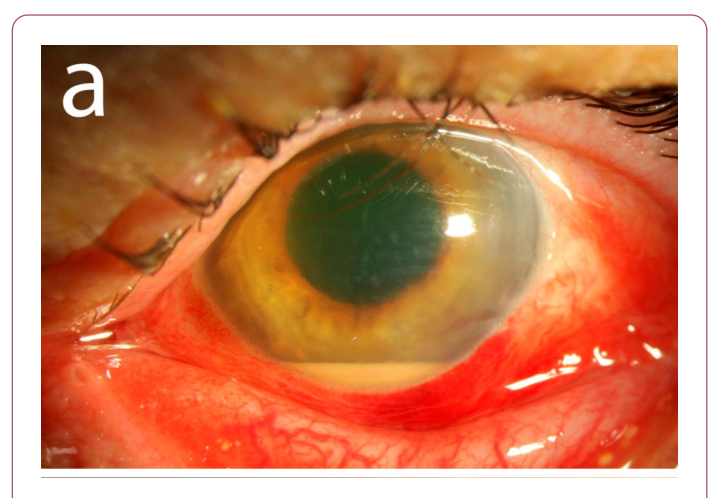
Figure 2a: 75 year old male with acute-onset endophthalmitis after intraoperative IOL exchange. Slit lamp examination revealed corneal edema and an anterior chamber inflammation with hypopyon. A temporal clear corneal incision was noted to be leaking on presentation. No sutures were present in the wound.

A 75 year old male had phacoemulsification and IOL exchange of the left eye at an outside institution seven days prior and presented with eye pain and decreased vision. The cataract surgery was performed using a clear corneal approach to phacoemulsification with a lens placed in the capsular bag. Intraoperative IOL exchange was performed as the surgeon noted a scratch on the optic of the initial IOL. The surgery was otherwise uncomplicated, without report of capsular rupture, vitreous loss, wound leakage or dehiscence. The patient presented to an outside ophthalmologist five davs postoperatively, and was diagnosed with acute-onset postoperative endophthalmitis and treated with intravitreal injections of vancomycin and ceftazidime. The patient noted continued deterioration of his vision and presented to our institution with light perception vision for further management at seven days postoperatively. Examination at our institution revealed a temporal clear corneal incision with wound leak and anterior chamber inflammation with hypopyon (Figure 2a).