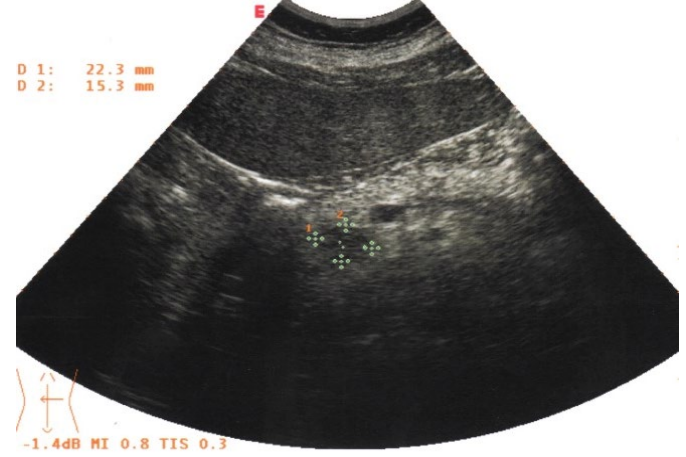
Figure 1. Insulinoma on pre-treatment abdomen ultrasonography: the pancreatic lesion appeared as a hypoechoic circular lesion.

BMI body mass index; FFM free fat mass; FM fat mass; REE resting energy expenditure; WHR Waist-to-hip ratio