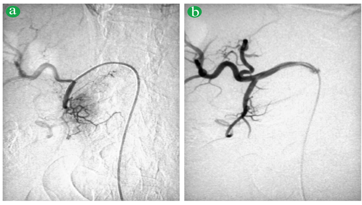
Figure 3. Angiogram of gastroduodenal artery. (a). In the late arterial phase the insulinoma appears as hypervasculated mass. (b). Angiogram 5 min after embolization demonstrates the insulinoma completely devascularized.

free of endocrine symptoms for 8 month. Due to residual tumor activity with mild symptom recurrence, she underwent repeat embolization in June 2008 without complications, which led to full biochemical and clinical control of the disease (Table 1). As a result, she lost a significant 28 kg in bodyweight with marked reduction of abdominal adiposity (trunk FM, 36.5%), and achieved significant improvements in echocardiography, oxygen saturation and pulmonary function tests. CT at 6 months post-embolization documented a marked reduction of the insulinoma size, which appeared as a hypovascular partly necrotic mass (Figure 2b) and remained unaltered for the following years. In 2012, however, recurrence of mild insulinoma-related symptoms led us to restart diazoxide therapy (up to 200 mg/die) with complete symptom control. Despite the lack of biochemical or clinical signs of multiple endocrine neoplasia (MEN), in 2014, due to the detection of isolated hypogonadotropinemia, the patient