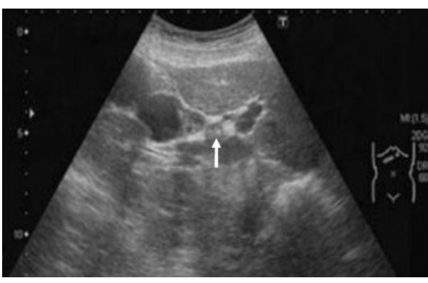
Figure 1. Abdominal ultrasound showing thickened lesion on neck of gallbladder (arrow).

A 60-year-old woman presenting with no symptoms and no history of biliary colic underwent routine abdominal ultrasonography (US) as part of a medical check-up. The US results revealed a nodular protrusion sized 15 mm at the neck of the gallbladder (Figure 1). Despite this abnormality, the patient's abdomen was unremarkable on physical examination. Neither the results of routine blood tests, which revealed serum carcinoembryonic antigen concentration (CEA) and CA 19-9 levels within normal ranges, nor magnetic resonance cholangiopancreatography (Figure 2), which detected no pancreaticobiliary maljunction, indicated any other abnormality. Although the nodular protrusion seemed likely to be a lymph node, gallbladder cancer could not be ruled out because it was a wide-based protrusion. To determine whether the protrusion was