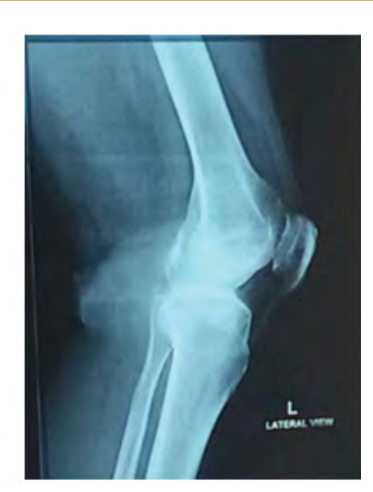
Figure 1 (a and b) X-ray pictures showing clear joint space narrowing during pre-treatment by the test product.